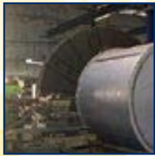
Production of rotating vacuum filter