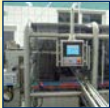
User friendly touch-screen