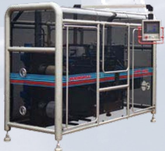
Wrappers For block size from 500 grams up to 5000 grams and different packaging materials or combinations of packaging materials