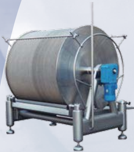
Rotating vacuum filters Size from 4 m 2 up to 24 m 2