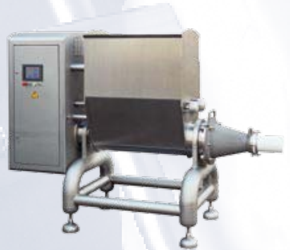
Extruders For blocks and noodles