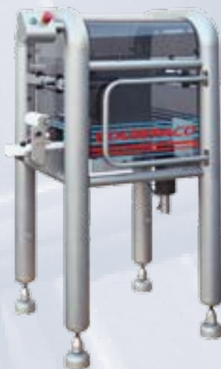
Cutters For block size from 500 grams up to 5000 grams