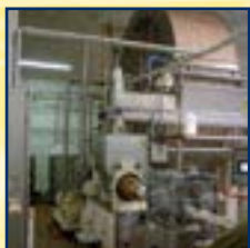
Completely reconditioned yeast packaging line