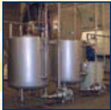
Testing of packaging line in Bouwpaco factory