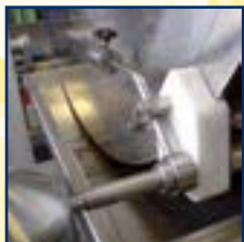
Completely closed drum rotating vacuum filter