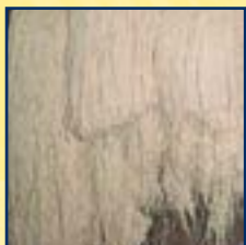
Extrusion of yeast noodles